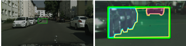
(a) Highlighted block. (b) Finished block annotation.