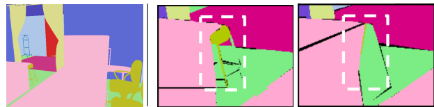
Figure 4: SUNCG/CGIntrinsics annotation . (a) Ground truth. (b) Block annotation (zoomed-in) (c) Full annotation (zoomed-in). White dotted box highlights an example where block annotation qualitatively outperforms full annotation. More in supplemental.

takes, synthetic datasets are generated with known ground truth labels with which annotation error can be computed. The CGIntrinsics dataset [35] contains physically-based renderings of indoor scenes from the SUNCG dataset [54, 63]. We use the more realistic CGIntrinsics renderings and the known semantic labels from SUNCG. The labels are categorized according to the NYU40[20] semantic categories. Due to the nature of indoor scenes, the depth and field of view of each image is smaller than outdoor datasets. The reduced complexity means that crowdworkers are able to produce good full-image annotations for this dataset.