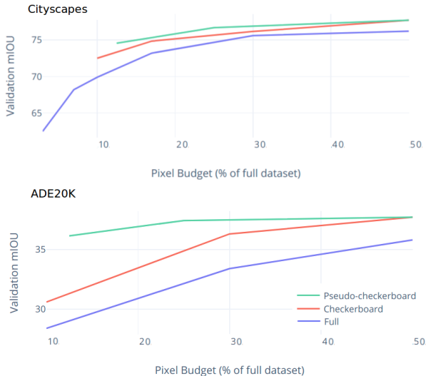
Figure 6: Semantic segmentation performance. Training images are annotated with different pixel budgets. Pseudo-checkerboard block annotation outperforms checkerboard and full annotation.

quality dense ground truth annotations and for their differences in number of images / classes and types of scenes represented. The block annotations are synthetically generated from the existing annotations.