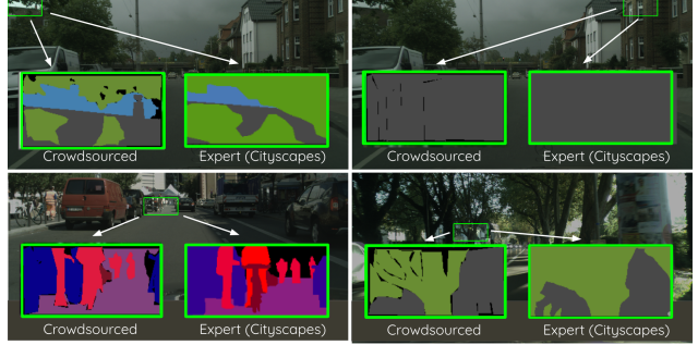
Figure 5: Crowdsourced vs expert segments. Crowdsourced block-annotated segments are compared to expert Cityscapes segments. Crowdsourced segments are colored for easier comparison. Top-left is a high-quality example. See supplemental for more.

Study Details. We searched for workers who produce high-quality work in a pilot study and found a set of 7 workers. These workers were found within a hundred pilot HITs