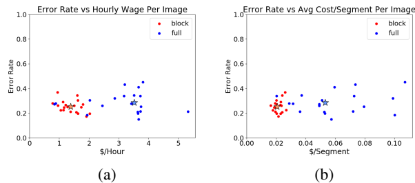
Figure 3: Annotation error rate for block and full annotation. Each point represents one image. The same set of images are both block annotated and full-image annotated. The stars represent the centroid (median). Cost/time include estimated cost/time to assign labels for each segment [8]. Lower-left is better . With block annotation, workers (a) choose to work for lower wages and (b) segment more regions for less pay per region. The overall quality is higher for block annotation.