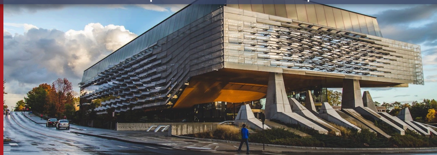
One Department: Two Campuses. Ithaca and New York City

A two-semester professional degree program designed to enhance practical skills. Flexible requirements make it possible to realize a broad range of CS-related career possibilities.