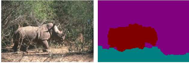
Figure 3. A multi-label segmentation result, on data from [12]. The purple label represents vegetation, red is rhino/hippo and blue is ground. There are 7 labels in the input problem, though only 3 are present in the output we obtain on this particular image.

sample result is shown in figure 3, using an image taken from the Corel dataset used in [12].